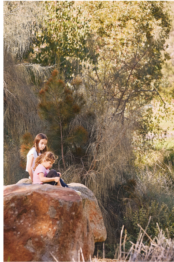
Jells Park Playscape

Waverley One sits within Melbourne's green wedge, a protected non-urban area designed to preserve natural landscapes, open space and opportunities for recreation. For residents, this means a lifestyle shaped by fresh air, greenery and room to explore, all while remaining close to everyday conveniences and established community amenity.