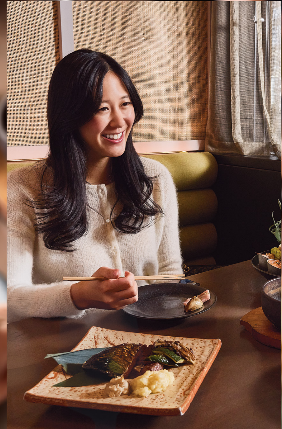
Wagyu Ya Teppanyaki