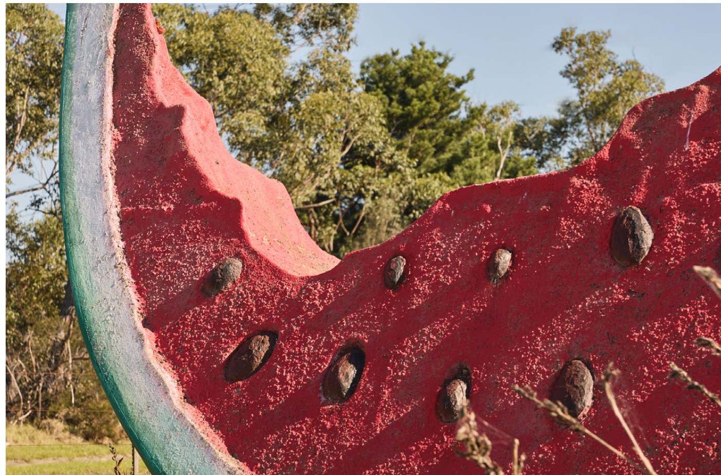
Big Watermelon Bushy Park