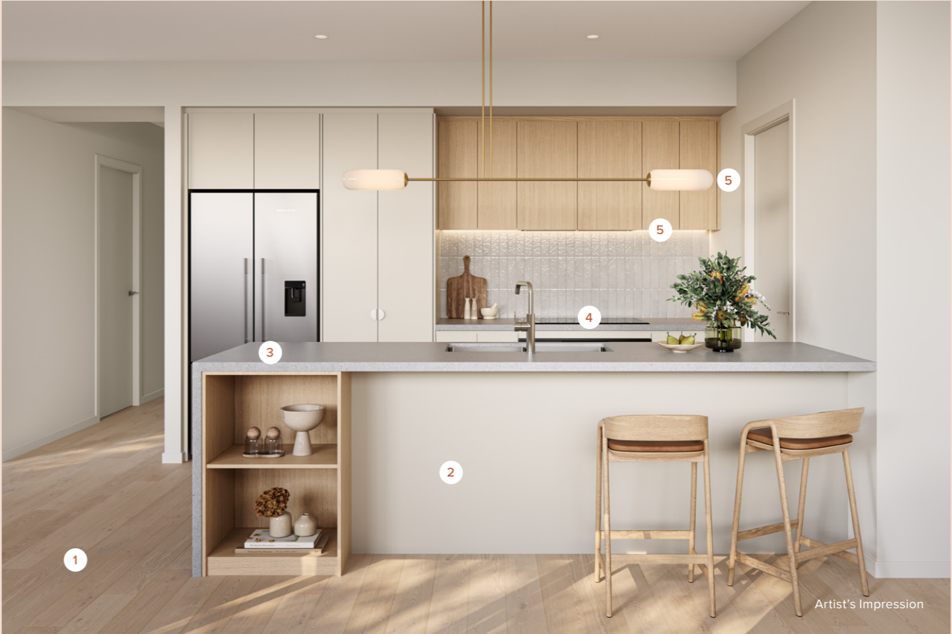
1. Engineered timber floors 2. Fully integrated dishwasher 3. Benchtop from Zenith Premium Range 4. European SMEG appliances 5. Feature lighting