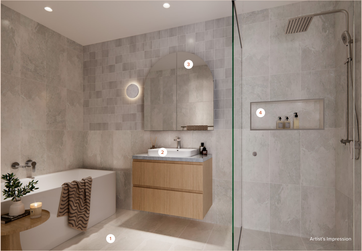
1. Oversized floor tiles 2. Designer basins & tapware 3. Vanity mirror cabinet 4. Inbuilt shower niche